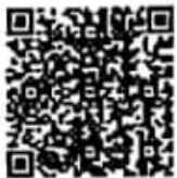
Director, Instructor OSHA.edu