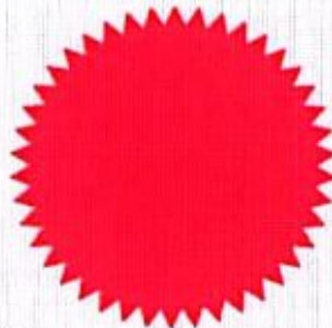
President Board of Medical Technology

Registration valid From: January 21, 2021 valid till December 22, 2026