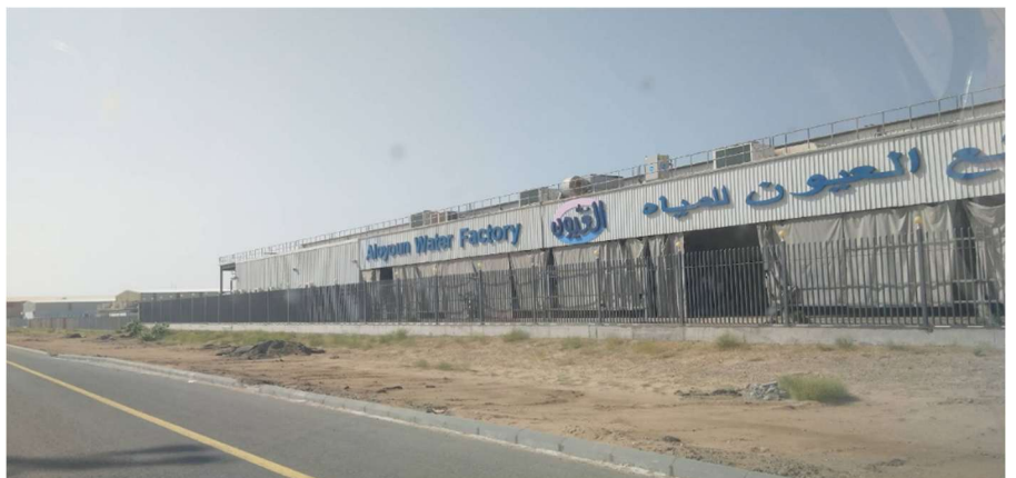
Water factory in the industrial city ( Alooyun )