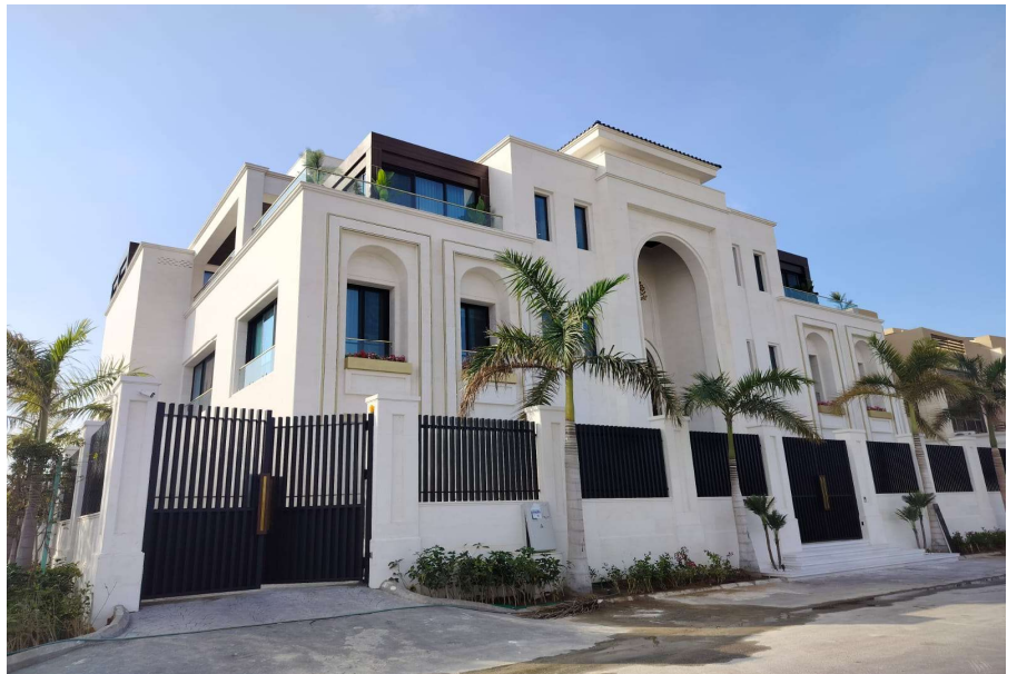
Private a luxurious palace ( private client )