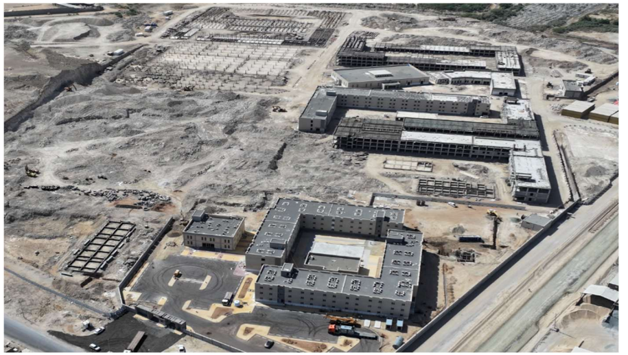
Labor housing complex for individuals ( Jeddah Municipality )