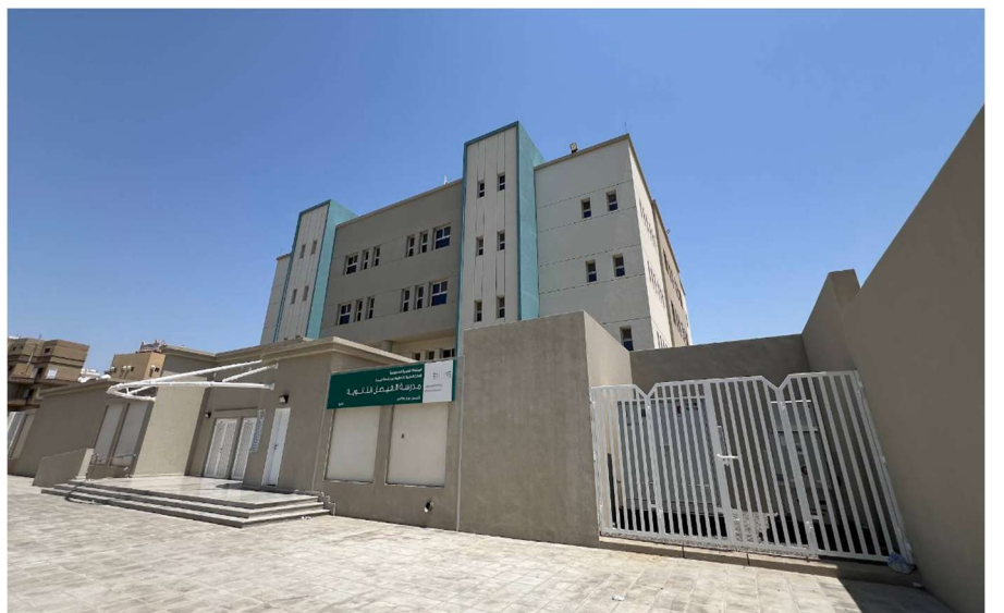
Secondary schools in Jeddah ( TBC )