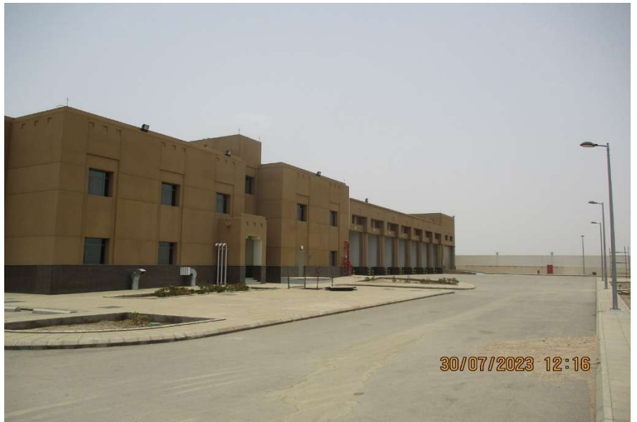
Civil Defense Center ( Ministry of Interior )