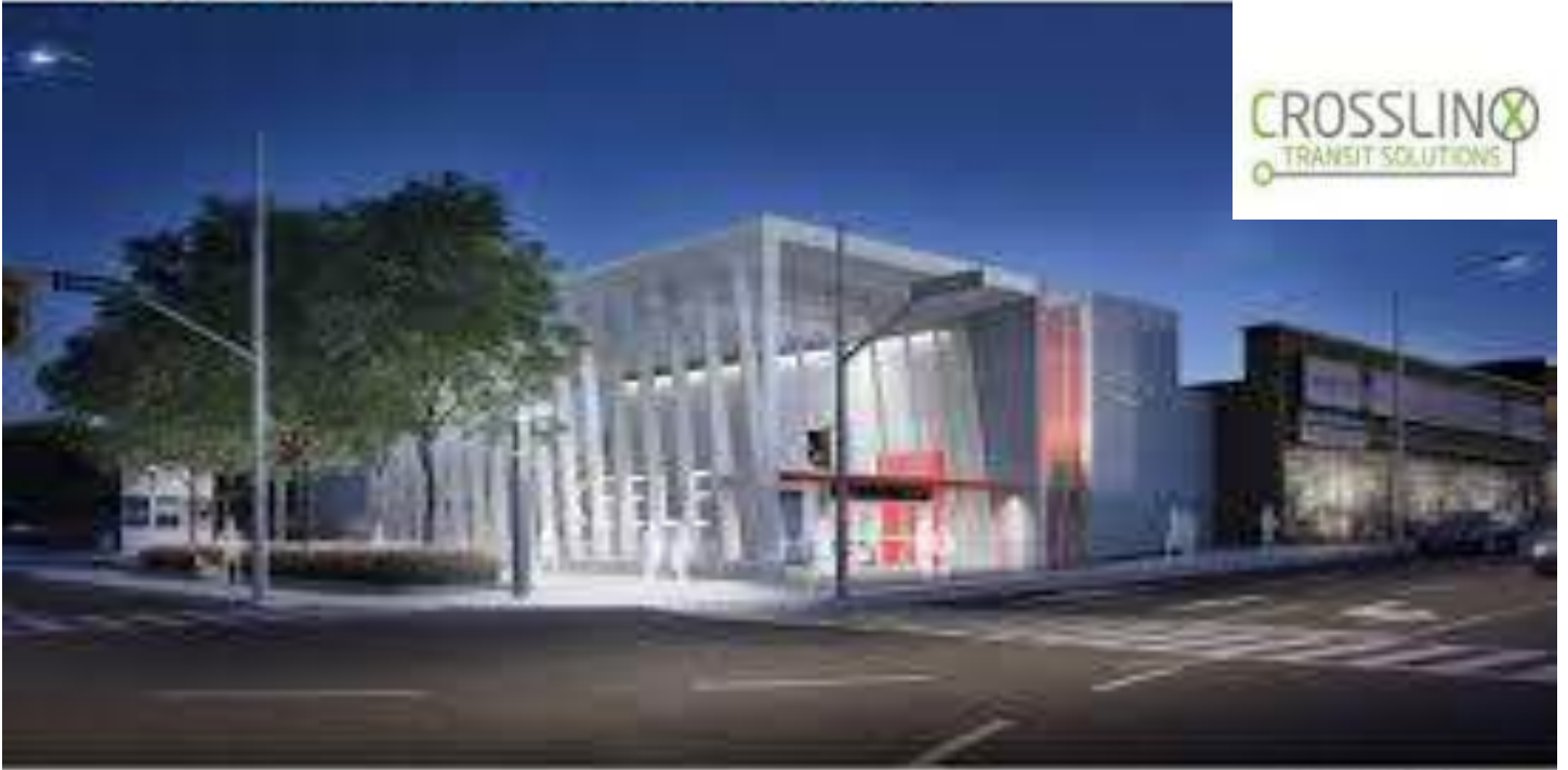
October 3, 2015 | Cyberon-Dumont - Design Review Panel Presentation