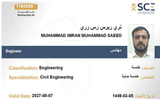
Civil Engineer-Saudi council of Engineers