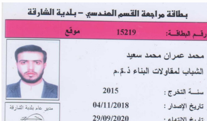
Civil Engineer-Sharjah Municipality-UAE