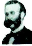
Jean Henry Dunant Founder of Red Cross 1828-1910