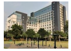
Venkateshwar Super Specialty Hospital, Dwarka, ND