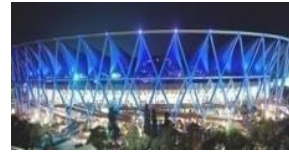
JLN Stadium, Lodi Road, New Delhi