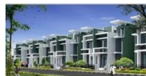
Villas at Wave City, Ghaziabad