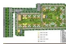
Mahagun Housing, Noida