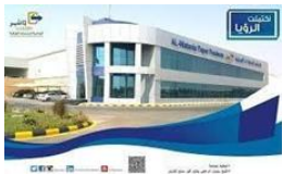
Watania Paper Products, Jed.