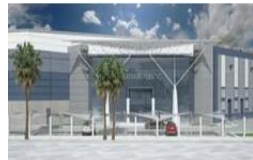
Watania Plastics, Jeddah