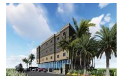
Worker's Residential complex, Dhurma, Riyadh