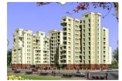
Housing for NHAI, Dwarka, New Delhi