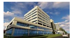
Commercial Building, Wave City Ghaziabad