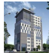
Venkateshwar Hospital, Pitampura, New Delhi