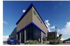
Containers Manufacturing Company, Riyadh