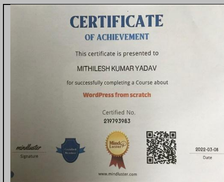
Online WordPress Certificate