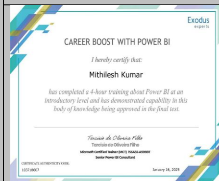
Online Power Bi Certificate