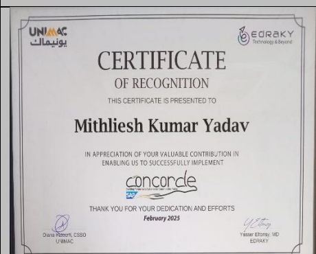
Appreciation Certificate - SAP