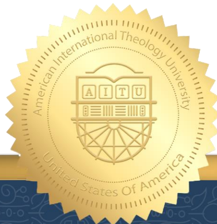
President of the University