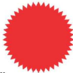
President Board of Medical Technology

Registration valid From: January 21, 2022 valid till December 22, 2026